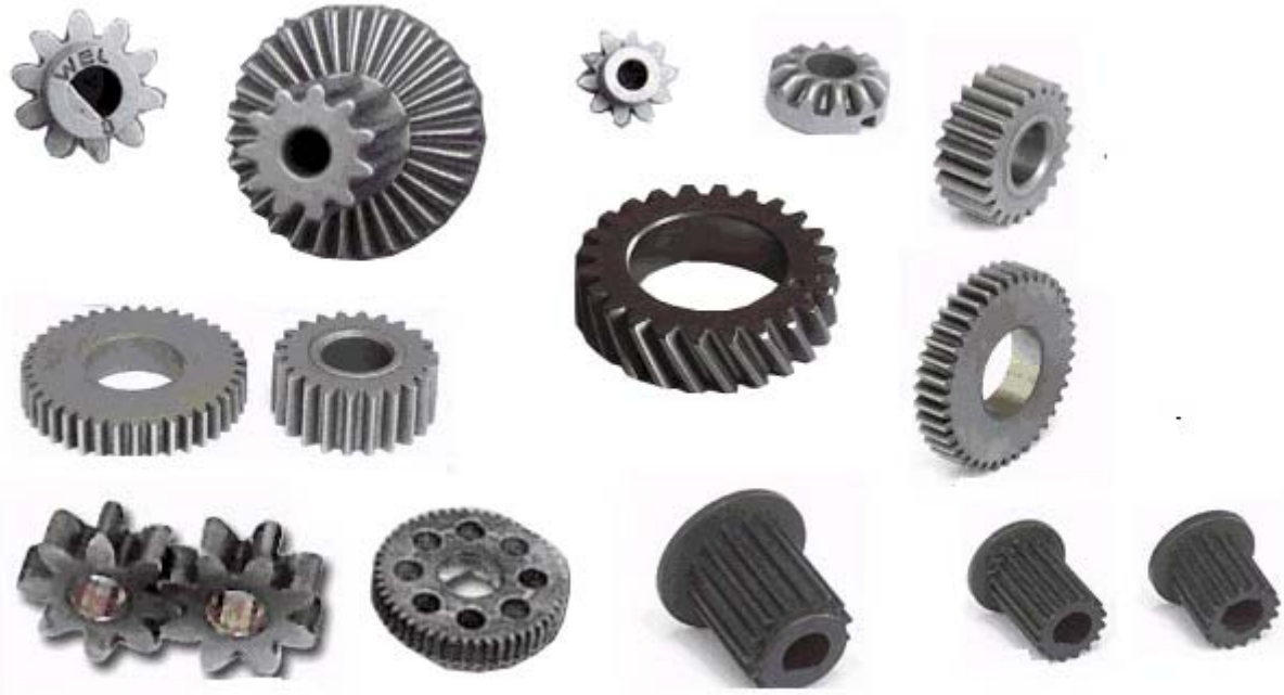
Transmission components part