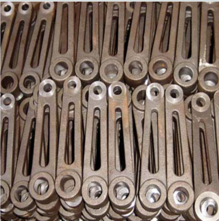
Precision Transmission Parts