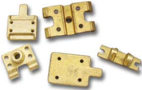
aluminium sand casting