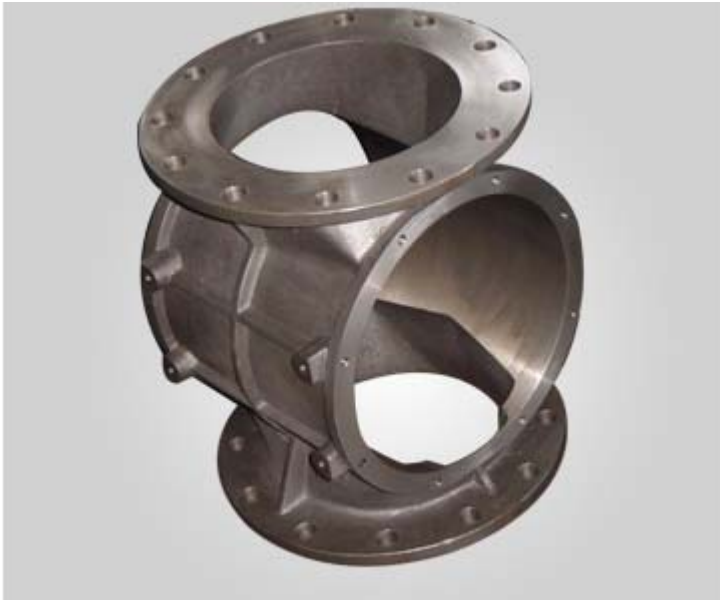
casting machining parts