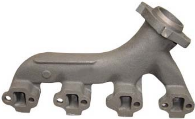
Sand casting machining