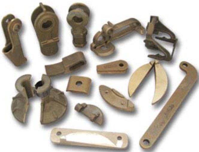
Sand casting machining part