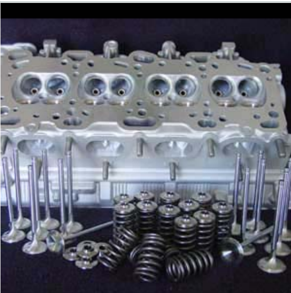
Precision machine part

We have been a leading manufacturer and exporter of Precision Parts