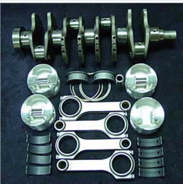
Precision machine part by Investment Casting