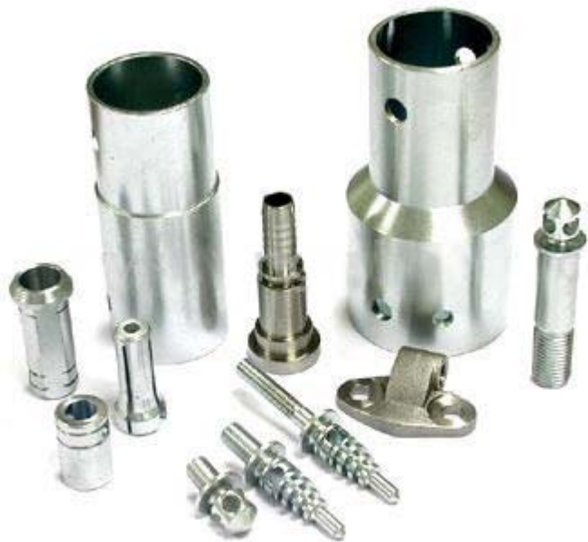
aluminum stamping part-02